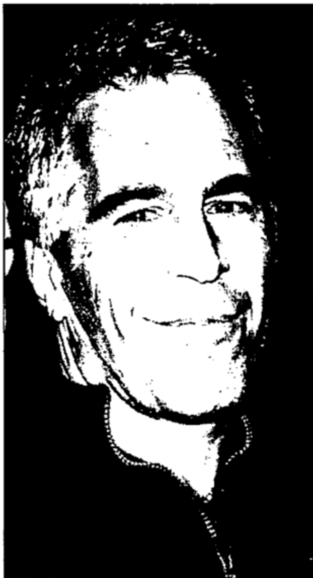
Conviction: Jeffrey Epstein

She met Andrew for the third and final time on Epstein's Caribbean island, Little Saint James. Virginia was never under the British legal age of consent when she met Andrew. She was 17 during the first two encounters and 18 at the third.