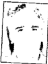
Epstein Money manager in New York has powerful allies.