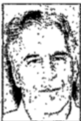
Epstein Accused of sexually assaulting then-14-year-old girl.