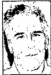
Epstein Palm Beacher serving 18 months in stockade for soliciting underage girl for prostitution.