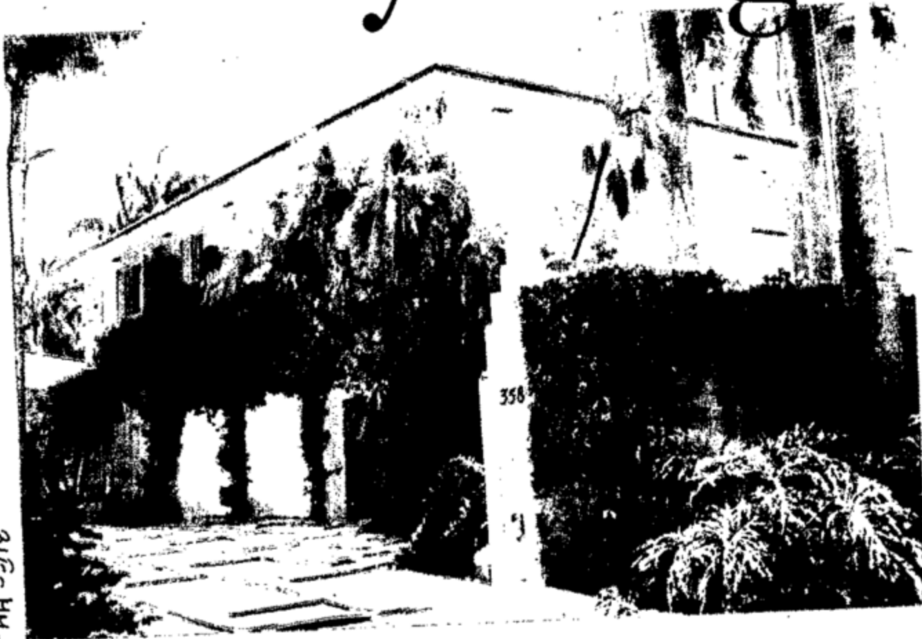
Epstein's Palm Beach mansion at 358 El Brillo Way.

Jeffrey Epstein craved big homes, elite friends and, investigators say, underage girls