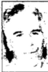
Epstein: His former attorney agreed to a plea bargain, police say.

Police also talked to somebody who said she was offered money if she refused to cooperate with the Palm Beach Police Department probe of Ep-