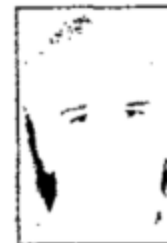
Jeffrey Epstein Indictment related to prostitution.

Epstein is the president of J Epstein & Co., a money management company based in Manhattan that caters to ultra-wealthy clientele, according to publication. See SOLICITING, 6B ▶